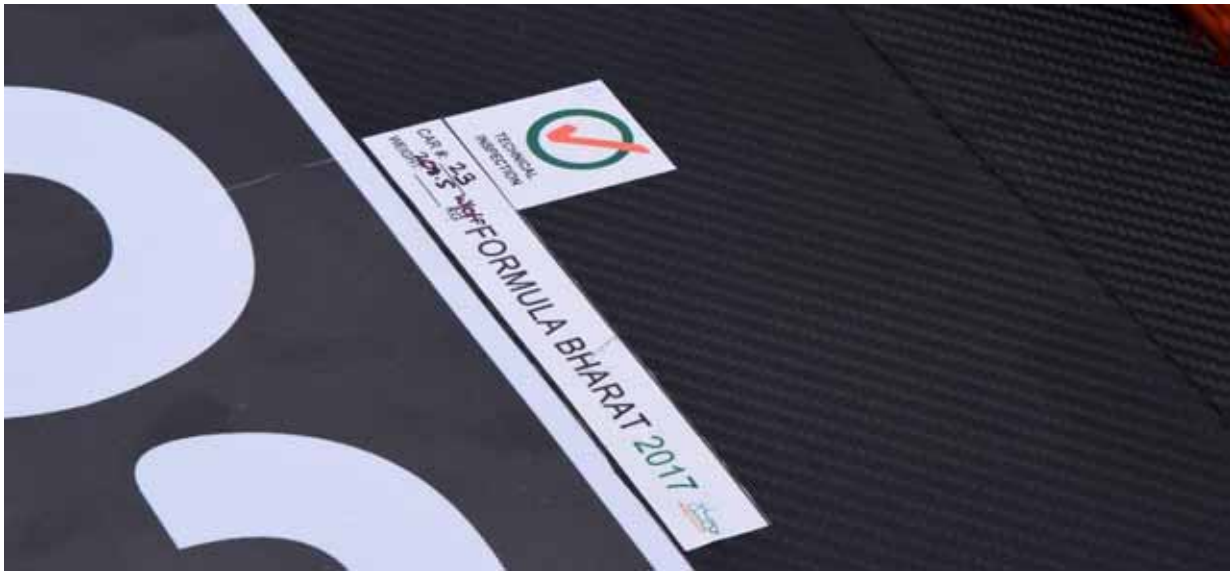
Image 09: Technical Inspection Sticker on GTM17

The car was moved to the fueling area where it was fueled up by the volunteers. Then the car was taken for tilt test where the car was mounted on a tilt table and the harness was tightened around the Main Roll hoop of the car so as to prevent car in case of roll over, and the car was tilted at 45 deg and then 60 deg from the horizontal and the car was checked for leaks. The fuel tank of the car was found to be leaking, so the car did not clear the tilt test. The car was taken back to the pit and the portion of the fuel tank from where the fuel was leaking was sealed using a M-seal. After sealing the fuel tank the car was again taken to the Tilt Area where the car was tilted again to check the leaks. During this attempt, no leaks were found and the GTM17 successfully cleared the Tilt Test.