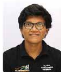
Deepan Pate Powertrain