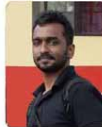
Sunil Kumar Electricals